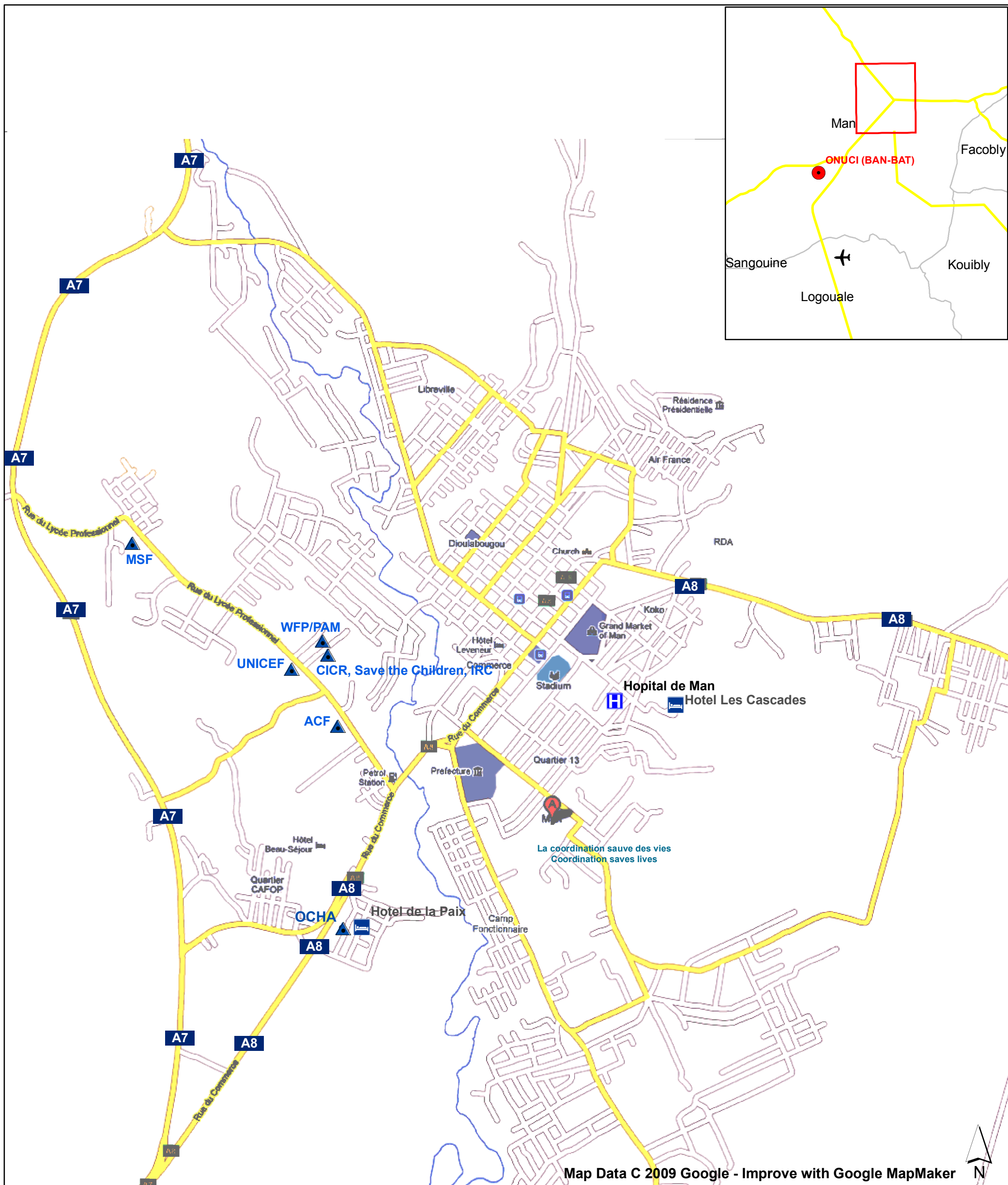
Map Data © 2009 Google - Improve with Google MapMaker