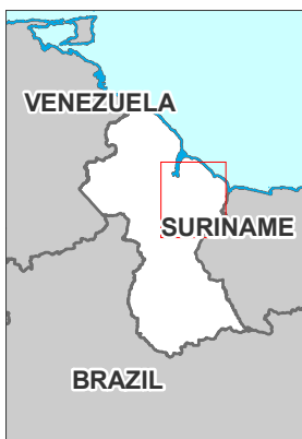
Map showing the location and occupancy of shelters in Mahaica Berbice and Upper Demerara-Berbice regions, Guyana