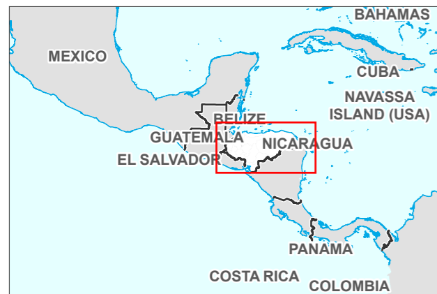
Country overview map showing main settlements, transport links, elevation, water features and administrative boundaries

The depiction and use of boundaries, names and associated data shown here do not imply endorsement or acceptance by MapAction.