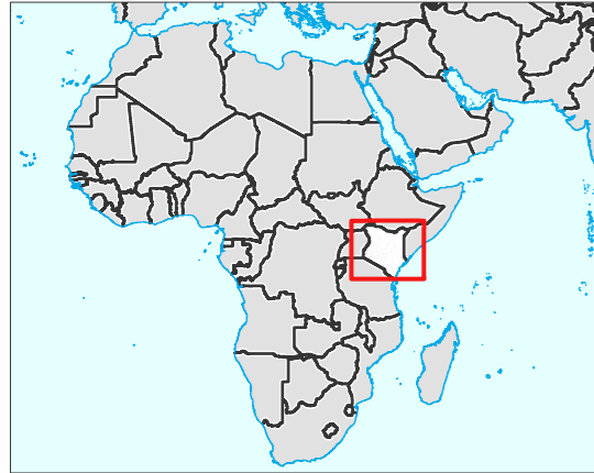
Country overview showing administrative boundaries, main settlements, transport infrastructure and natural features