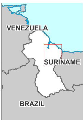
Map showing the location and occupancy of shelters in Mahaica Berbice and Upper Demerara-Berbice regions, Guyana