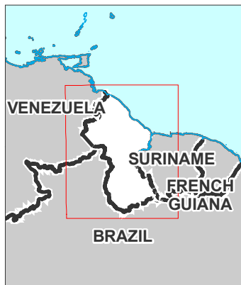
Map shows the Administrative boundaries as June 2021