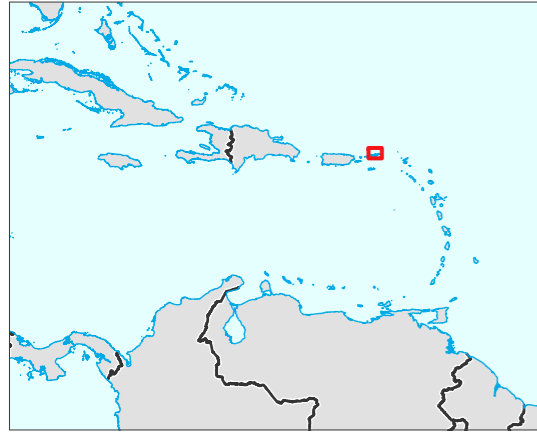
Country overview showing administrative boundaries, main settlements, transport infrastructure and natural features