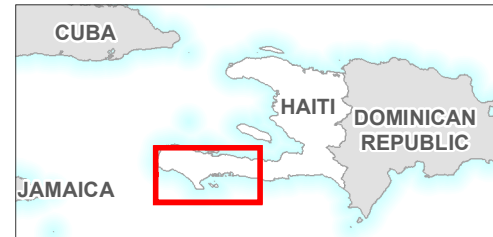
Map showing health facilities with level of damage in department Sud. Map based upon data published by PAHO accessed on 31/08/2021