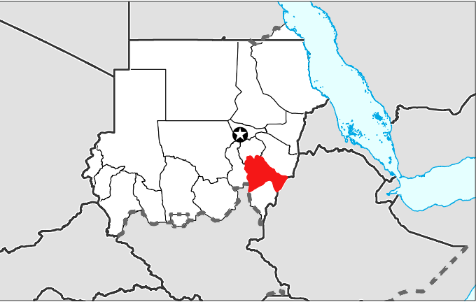
Map atlas of district boundaries within each state (administrative level 1) and main settlements