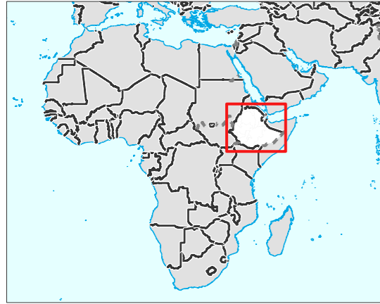
Country overview showing administrative boundaries, main settlements, transport infrastructure and natural features