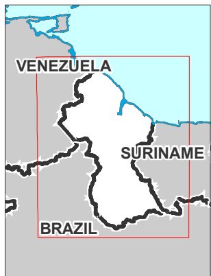
Map shows the Administrative boundaries as June 2021