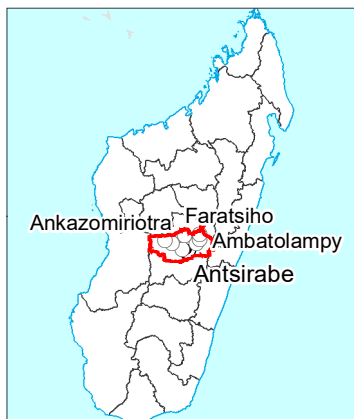
Atlas of Region and District Boundaries including P-Codes