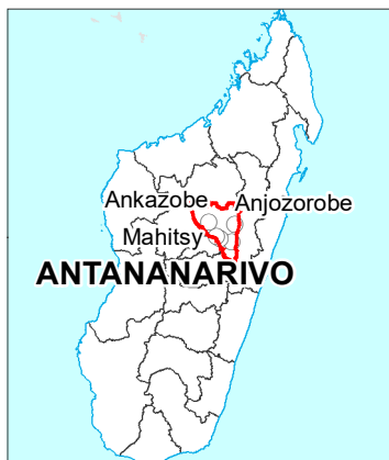
Atlas of Region and District Boundaries including P-Codes