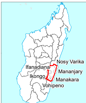
Atlas of Region and District Boundaries including P-Codes