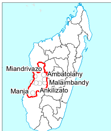
Atlas of Region and District Boundaries including P-Codes