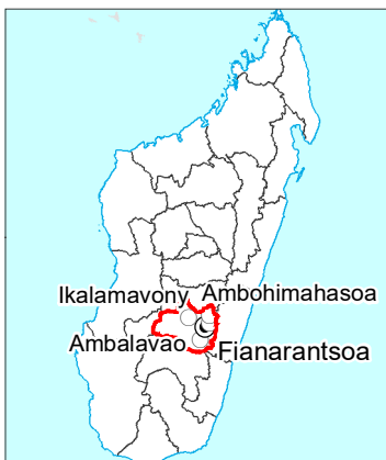
Atlas of Region and District Boundaries including P-Codes