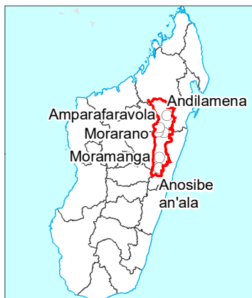
Atlas of Region and District Boundaries including P-Codes