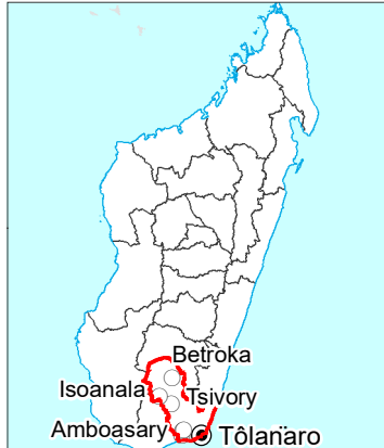
Atlas of Region and District Boundaries including P-Codes