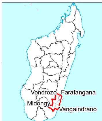
Atlas of Region and District Boundaries including P-Codes