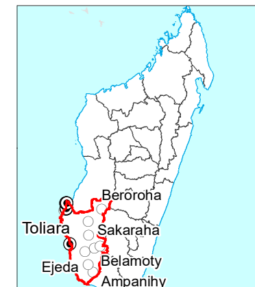
Atlas of Region and District Boundaries including P-Codes