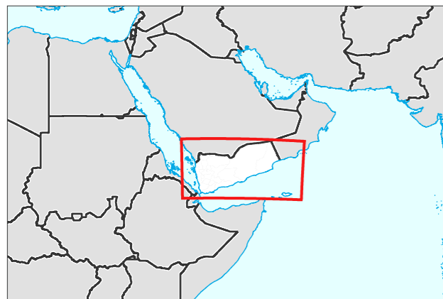
Country overview showing administrative boundaries, main settlements, transport infrastructure and natural features