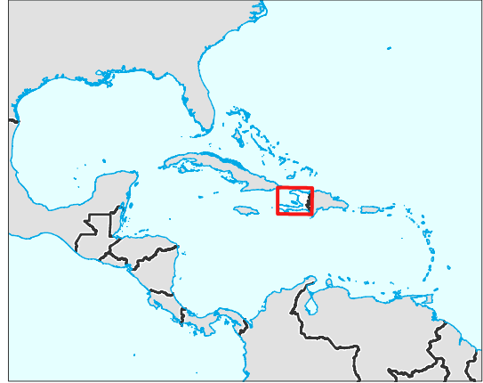
Administrative level 1 boundaries [departments] with main settlements