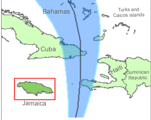
Shows Forecast track as of 3 Oct

General Topography Map of Jamaica for orientation, including major settlement, topography and transport infrastructure.