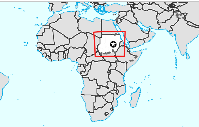
Country overview showing administrative boundaries, main settlements, transport infrastructure and natural features