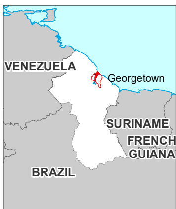
Map shows each individual Regions with Sub-divisions displayed and named